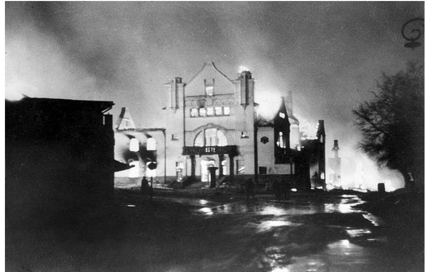
The city hall – due to the bombing 11 th of April 1940