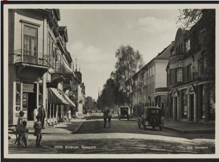
The main street – 1930's